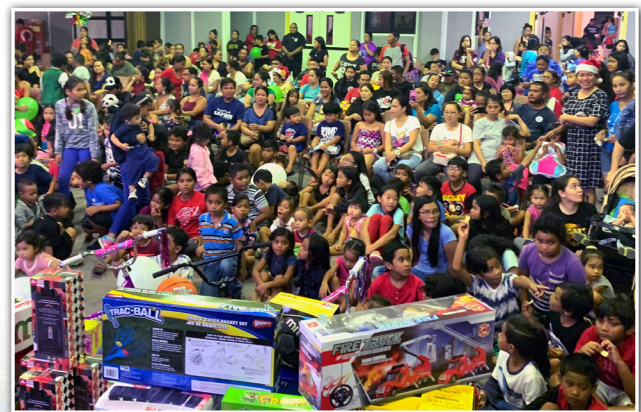
Toddlers and Youths during the Toys for Tots distribution of gifts on December 18, 2019.