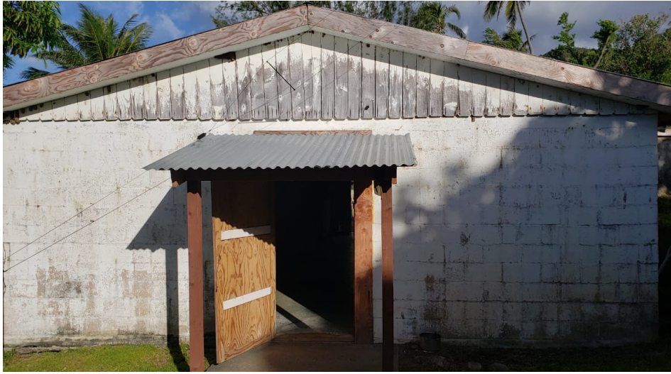
Newly renovated roof for Agrihan dispensary/Mayor's Office.

Citizen-Centric Report (Pursuant to PL-20-83)