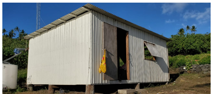
Mayor's Office on Alamagan