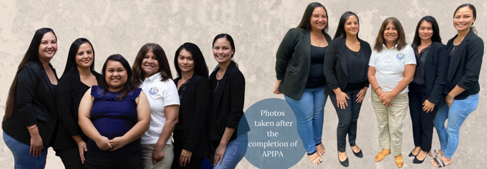
Photos taken after the completion of APIPA