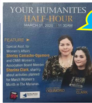
Outreach & Awareness