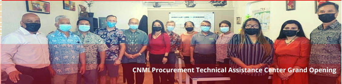
CNMI Procurement Technical Assistance Center Grand Opening

In Fiscal Year 2021, the leadership and staff of CBMA achieved the following under the mandates provided by Executive Order 2019-09: