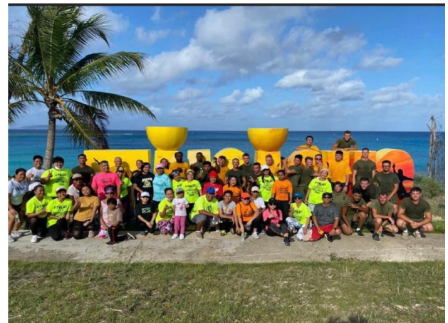
A group photo with U.S. Military personnel and community members that participated in the Hero Fun Run on May 15, 2021