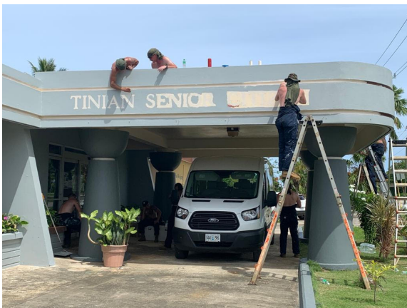
Reopening of the Tinian Senior Center made possible through the Community Relations (COMREL) Partnership with the NMCB Seabees and the Marines 7th Engineer Support Battalion. Renovation included roof repair, painting and replaced kitchen sink to meet FDA/ADA requirements.