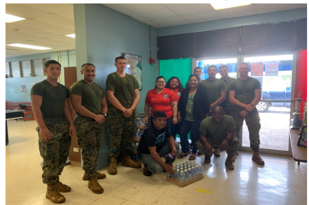
7th Engineer Support Battalion donating water to the Tinian Elementary and High School. Water was brought to support the Freedom Banner exercise which was cancelled due to weather conditions. CBMA aided in the coordination of the donation.