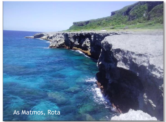
As Matmos, Rota

To control bacterial contamination in our water, CUC water operators add trace amounts of chlorine to the water before it is distributed into the pipelines to you, our customer.