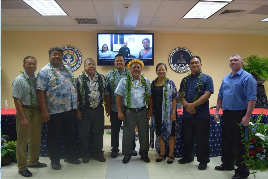
State of the Municipality Address