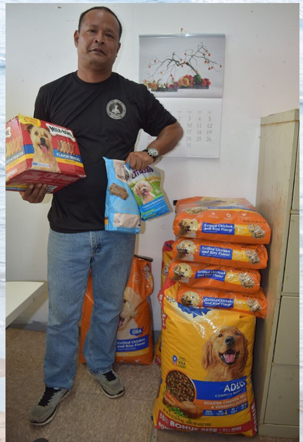
Donation of dog supplies from the Humane Society