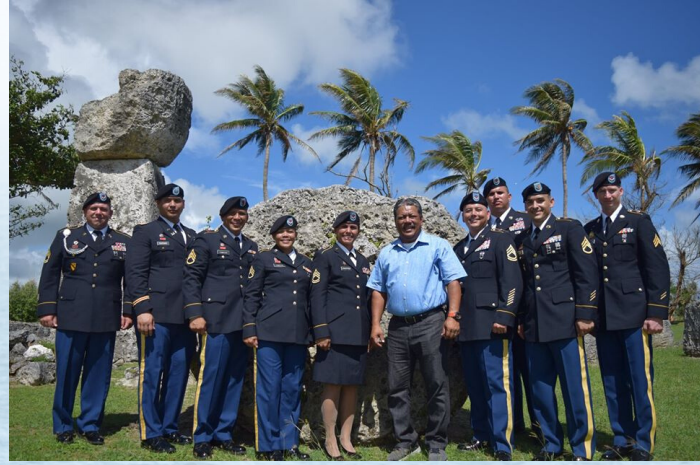
Veteran's Day Ceremony