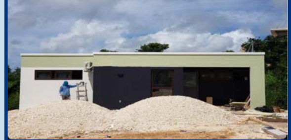
Typhoon Reinforced Design Under Review

A Program Manager and Finance Manager have been recently hired, a dedicated office has been secured, top infrastructure projects lists were transmitted to the Governor in September 2019, for his review and approval, requisite data mining series of meetings with key State stakeholders have begun and are ongoing, data sharing Memorandums of Understanding to US FEMA and US SBA required for grant planning. Working drafts of the action plan and corresponding policies and procedures have begun. As of September 30, 2019, NMHC so far has expended $100,145 for the ongoing preparation.