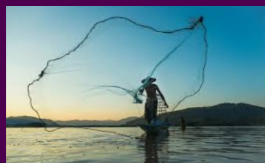
Round 2 of the CARES Act Fisheries Assistance will be handled by the DFW, DLNR.