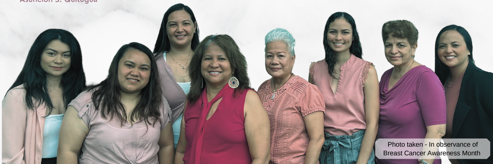
Photo taken - In observance of Breast Cancer Awareness Month