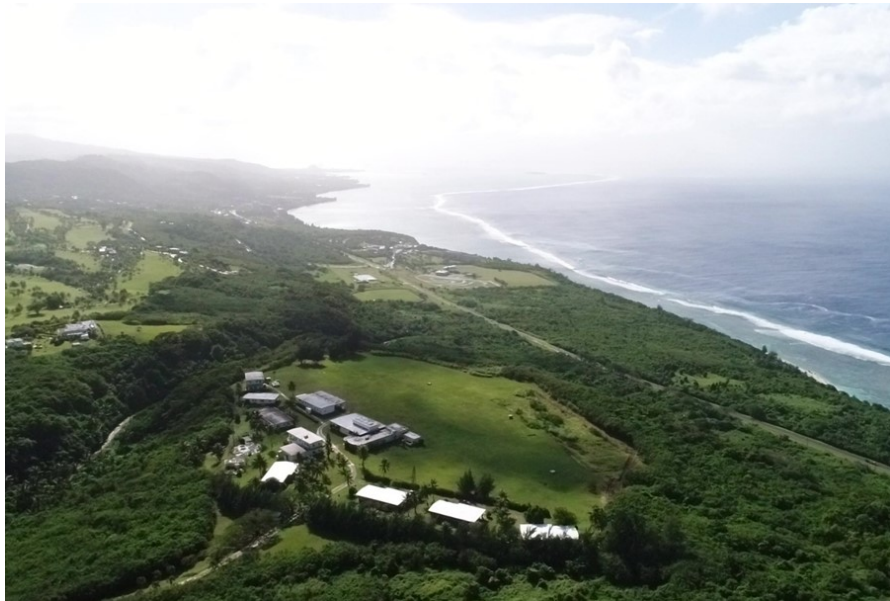
HOPE Recovery Center Marpi, Saipan, Commonwealth of the Northern Mariana Islands